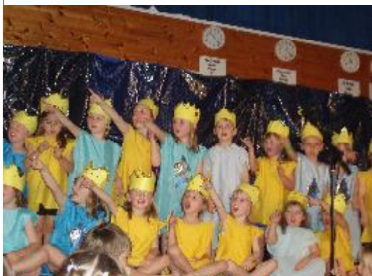
Our Kings at Christmas!

Our phonic work has been going really well with the children learning the sounds and how to write them. We will be continuing this and introducing tricky words ! These are words that can not be phonetically sounded and need to be recognised by sight. We will be sending home tricky words within the next few weeks for the children to learn, as always little and often.