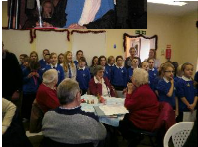
Entertaining at Rialton Heights and Holly Bush Residential Care Homes.