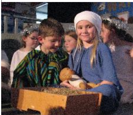
A scene from our Christmas Play.

This half term our topic is ' Day and Night ' and we begin our Entry Point with a very exciting visit from Newquay Zoo! During this time