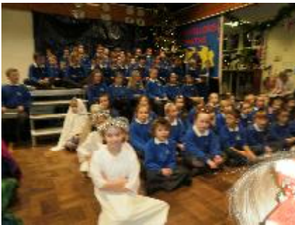
Entertaining invited Senior Citizen guests. Carols followed by cakes and tea!