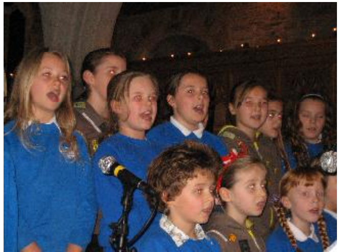
Joining other groups at St Columb Minor Church.